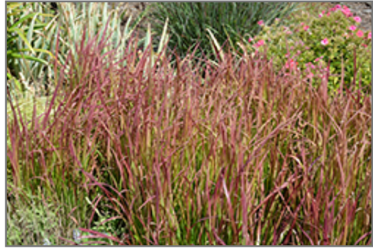
Red Baron Japanese Blood Grass

Red Baron Japanese Blood Grass will grow to be about 20 inches tall at maturity, with a spread of 18 inches. It grows at a slow rate, and under ideal conditions can be expected to live for approximately 20 years. As an herbaceous perennial, this plant will usually die back to the crown each winter, and will regrow from the base each spring. Be careful not to disturb the crown in late winter when it may not be readily seen!