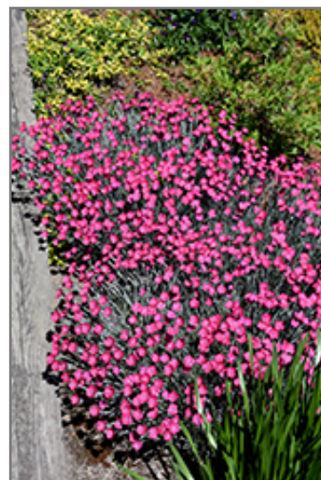
Wicked Witch Pinks in bloom