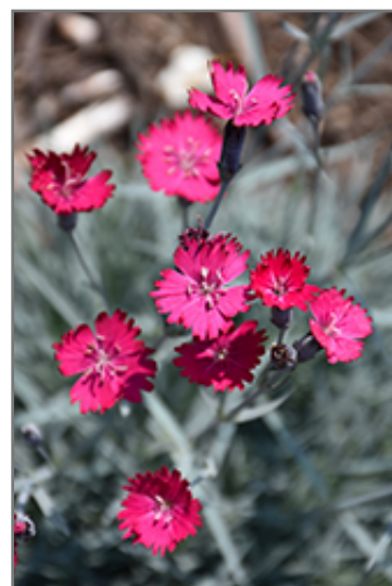
Wicked Witch Pinks flowers

Wicked Witch Pinks is recommended for the following landscape applications;