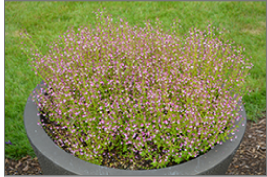
Fairy Dust Pink Cuphea in bloom

Fairy Dust Pink Cuphea will grow to be about 12 inches tall at maturity extending to 16 inches tall with the flowers, with a spread of 15 inches. When grown in masses or used as a bedding plant, individual plants should be spaced approximately 10 inches apart. Its foliage tends to remain dense right to the ground, not requiring facer plants in front. Although it's not a true annual, this plant can be expected to behave as an annual in our climate if left outdoors over the winter, usually needing replacement the following year. As such, gardeners should take into consideration that it will perform differently than it would in its native habitat.