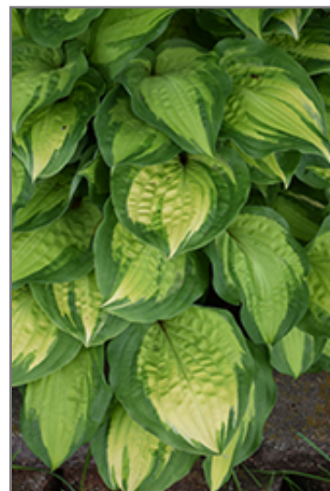
Island Breeze Hosta foliage