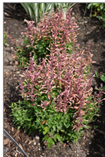
Mango Tango Hyssop in bloom