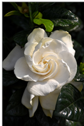
Sweet Tea Gardenia flowers

There are many factors that will affect the ultimate height, spread and overall performance of a plant when grown indoors; among them, the size of the pot it's growing in, the amount of light it receives, watering frequency, the pruning regimen and repotting schedule. Use the information described here as a guideline only; individual performance can and will vary. Please contact the store to speak with one of our experts if you are interested in further details concerning recommendations on pot size, watering, pruning, repotting, etc.