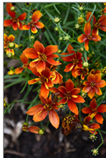
Sizzle And Spice Crazy Cayenne Tickseed flowers

Sizzle And Spice Crazy Cayenne Tickseed is recommended for the following landscape applications;