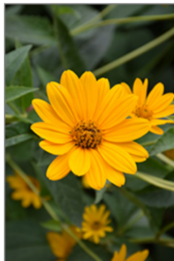
False Sunflower flowers

False Sunflower is recommended for the following landscape applications;