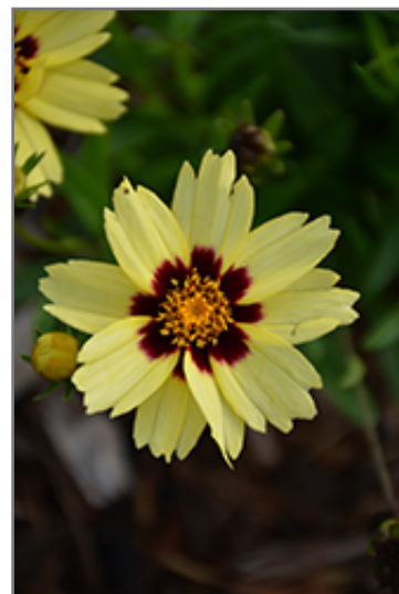
UpTick Cream and Red Tickseed flowers

UpTick Cream and Red Tickseed is recommended for the following landscape applications;