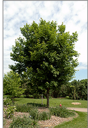
Sugar Maple

This tree should only be grown in full sunlight. It prefers to grow in average to moist conditions, and shouldn't be allowed to dry out. It is not particular as to soil pH, but grows best in rich soils. It is somewhat tolerant of urban pollution. This species is native to parts of North America.