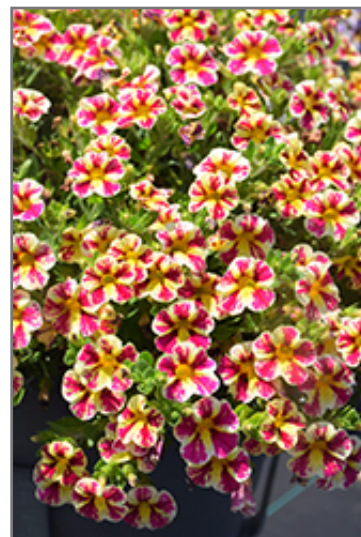
Superbells Holy Moly! Calibrachoa flowers

This plant will require occasional maintenance and upkeep. Trim off the flower heads after they fade and die to encourage more blooms late into the season. It is a good choice for attracting bees and hummingbirds to your yard, but is not particularly attractive to deer who tend to leave it alone in favor of tastier treats. It has no significant negative characteristics.