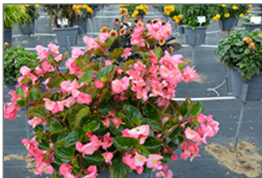
Big Pink Green Leaf Begonia in bloom

Big Pink Green Leaf Begonia is a fine choice for the garden, but it is also a good selection for planting in outdoor containers and hanging baskets. It is often used as a 'filler' in the 'spiller-thriller-filler' container combination, providing a mass of flowers and foliage against which the larger thriller plants stand out. Note that when growing plants in outdoor containers and baskets, they may require more frequent waterings than they would in the yard or garden.