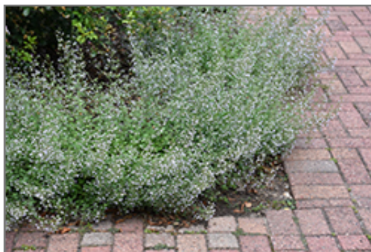
Blue Cloud Dwarf Calamint in bloom

Blue Cloud Dwarf Calamint is recommended for the following landscape applications;