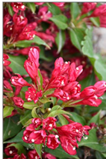
Crimson Kisses Weigela flowers