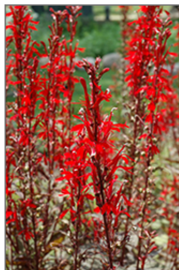
Black Truffle Cardinal Flower flowers