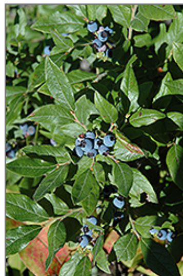
Lowbush Blueberry fruit

This is an open spreading deciduous shrub with a spreading, ground-hugging habit of growth. Its relatively fine texture sets it apart from other landscape plants with less refined foliage. This is a relatively low maintenance plant, and usually looks its best without pruning, although it will tolerate pruning. It is a good choice for attracting birds to your yard. It has no significant negative characteristics.