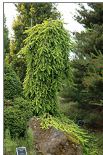
Gold Drift Norway Spruce