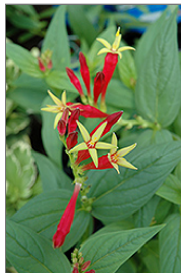
Indian Pink flowers

Indian Pink is recommended for the following landscape applications;