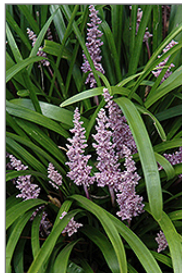
Lily Turf flowers