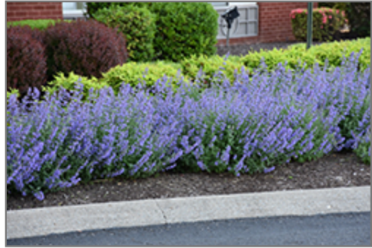
Cat's Meow Catmint in bloom

Cat's Meow Catmint will grow to be about 16 inches tall at maturity, with a spread of 30 inches. Its foliage tends to remain dense right to the ground, not requiring facer plants in front. It grows at a fast rate, and under ideal conditions can be expected to live for approximately 10 years. As an herbaceous perennial, this plant will usually die back to the crown each winter, and will regrow from the base each spring. Be careful not to disturb the crown in late winter when it may not be readily seen!