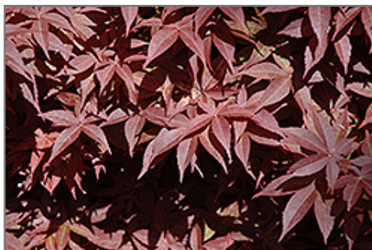
Rhode Island Red Japanese Maple foliage