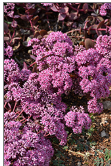
Cherry Tart Stonecrop flowers

Cherry Tart Stonecrop is a fine choice for the garden, but it is also a good selection for planting in outdoor pots and containers. It is often used as a 'filler' in the 'spiller-thriller-filler' container combination, providing a mass of flowers and foliage against which the larger thriller plants stand out. Note that when growing plants in outdoor containers and baskets, they may require more frequent waterings than they would in the yard or garden.