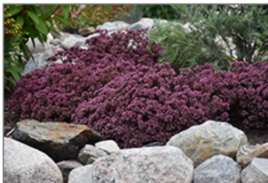
Cherry Tart Stonecrop in bloom

Cherry Tart Stonecrop is a dense herbaceous perennial with an upright spreading habit of growth. Its medium texture blends into the garden, but can always be balanced by a couple of finer or coarser plants for an effective composition.