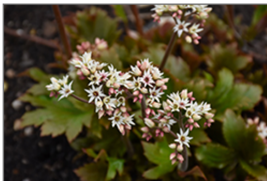
Karasuba Mukdenia flowers