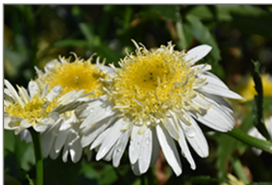
Realflor Real Glory Shasta Daisy flowers

Realflor Real Glory Shasta Daisy is recommended for the following landscape applications;