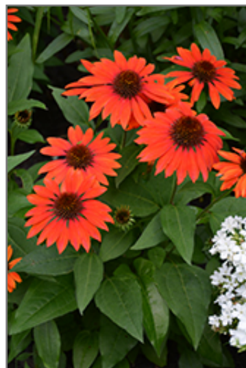
Sombrero Flamenco Orange Coneflower in bloom

Sombrero Flamenco Orange Coneflower is recommended for the following landscape applications;