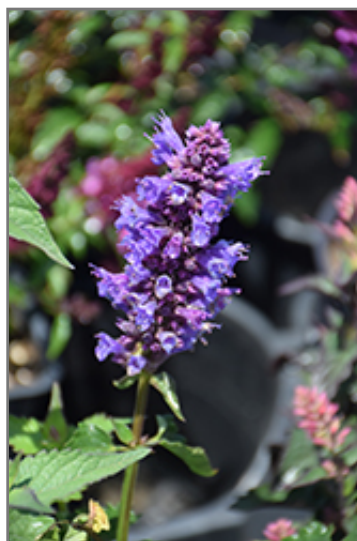
Blue Boa Hyssop flowers