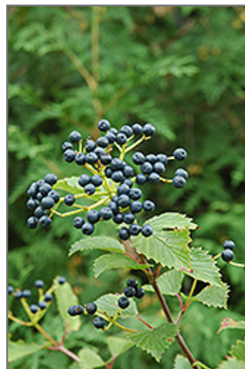
Blue Muffin Viburnum fruit

Blue Muffin Viburnum is recommended for the following landscape applications;