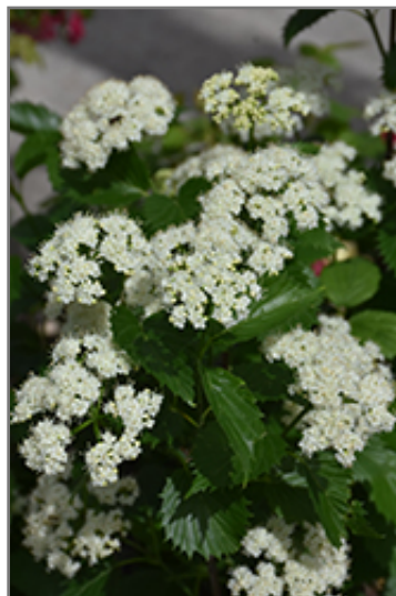
Blue Muffin Viburnum flowers