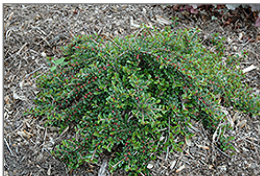
Little Gem Cotoneaster