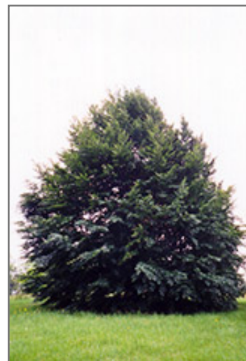
European Beech