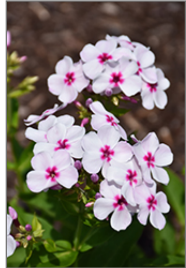
Flame White Eye Garden Phlox flowers

Flame White Eye Garden Phlox is a fine choice for the garden, but it is also a good selection for planting in outdoor pots and containers. With its upright habit of growth, it is best suited for use as a 'thriller' in the 'spiller-thriller-filler' container combination; plant it near the center of the pot, surrounded by smaller plants and those that spill over the edges. Note that when growing plants in outdoor containers and baskets, they may require more frequent waterings than they would in the yard or garden.