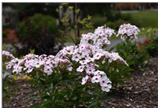
Flame White Eye Garden Phlox in bloom