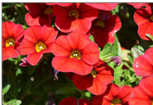
Superbells Red Calibrachoa flowers