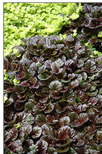
Black Scallop Bugleweed