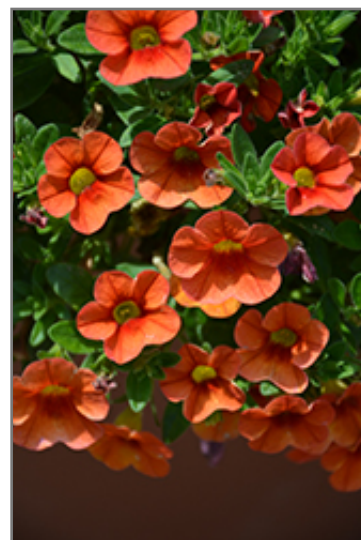
Aloha Hot Orange Calibrachoa flowers