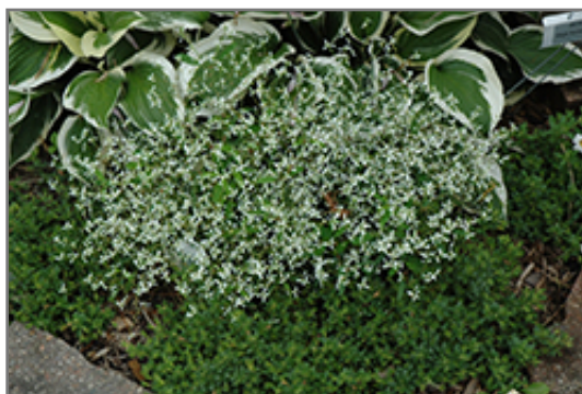
Diamond Frost Euphorbia in bloom