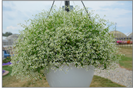
Diamond Frost Euphorbia in bloom

Diamond Frost Euphorbia is a fine choice for the garden, but it is also a good selection for planting in outdoor containers and hanging baskets. It is often used as a 'filler' in the 'spiller-thriller-filler' container combination, providing a mass of flowers against which the thriller plants stand out. Note that when growing plants in outdoor containers and baskets, they may require more frequent waterings than they would in the yard or garden.