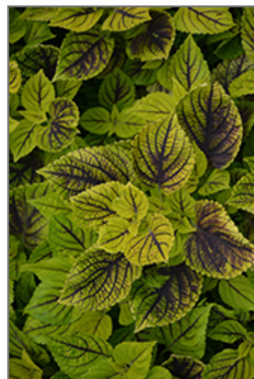
Gays Delight Coleus foliage