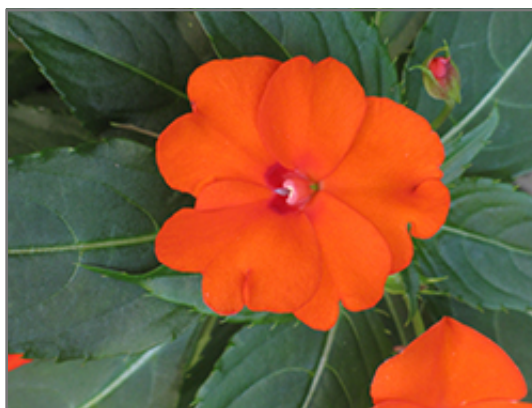
Infinity Orange New Guinea Impatiens flowers

Infinity Orange New Guinea Impatiens is recommended for the following landscape applications;