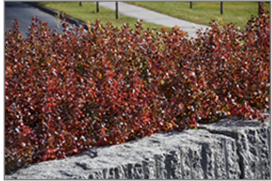
Gro-Low Fragrant Sumac in fall

This shrub performs well in both full sun and full shade. It is very adaptable to both dry and moist locations, and should do just fine under typical garden conditions. It is not particular as to soil type, but has a definite preference for acidic soils, and is subject to chlorosis (yellowing) of the foliage in alkaline soils. It is highly tolerant of urban pollution and will even thrive in inner city environments. Consider applying a thick mulch around the root zone in winter to protect it in exposed locations or colder microclimates. This is a selection of a native North American species.