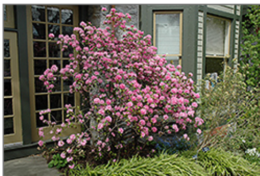
Olga Mezitt Rhododendron in bloom