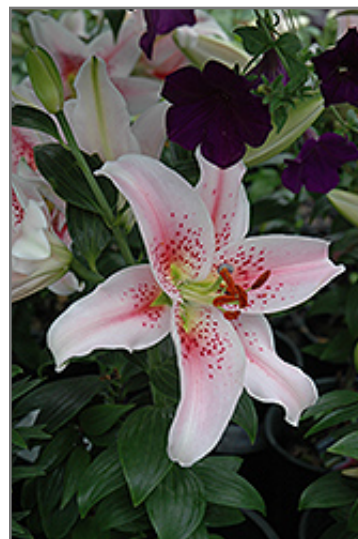
Mona Lisa Lily flowers