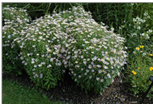
Blue Star Japanese Aster in bloom