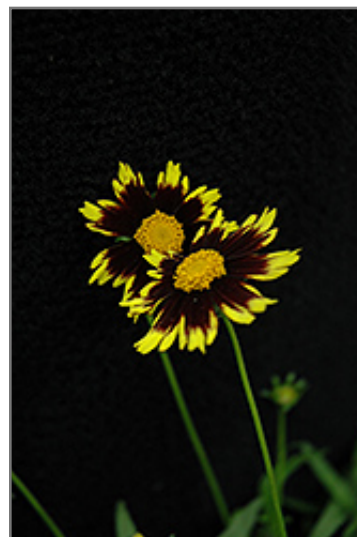
Cosmic Eye Tickseed flowers

Cosmic Eye Tickseed is recommended for the following landscape applications;