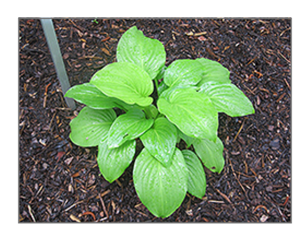
Venus Hosta