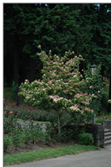
Heart Throb Chinese Dogwood in bloom