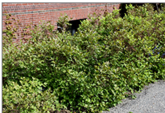
Shrub Yellowroot