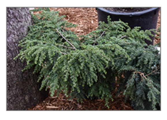
Dawsoniana Hemlock