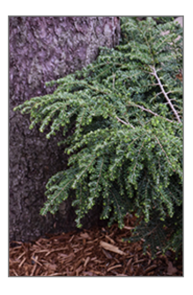
Dawsoniana Hemlock foliage