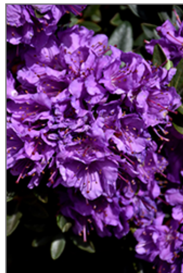
Purple Gem Rhododendron flowers