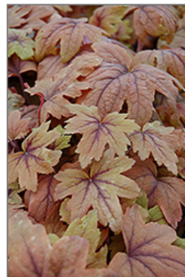
Sweet Tea Foamy Bells foliage