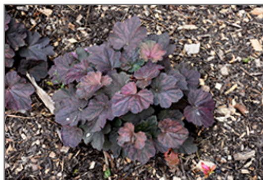
Mocha Coral Bells