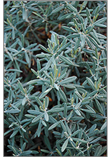
Blue Ice Bog Rosemary foliage

This shrub does best in full sun to partial shade. It prefers to grow in moist to wet soil, and will even tolerate some standing water. It is not particular as to soil type, but has a definite preference for acidic soils, and is subject to chlorosis (yellowing) of the foliage in alkaline soils. It is somewhat tolerant of urban pollution, and will benefit from being planted in a relatively sheltered location. Consider applying a thick mulch around the root zone in winter to protect it in exposed locations or colder microclimates. This is a selection of a native North American species.