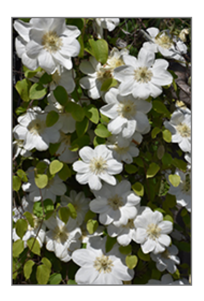
Guernsey Cream Clematis flowers